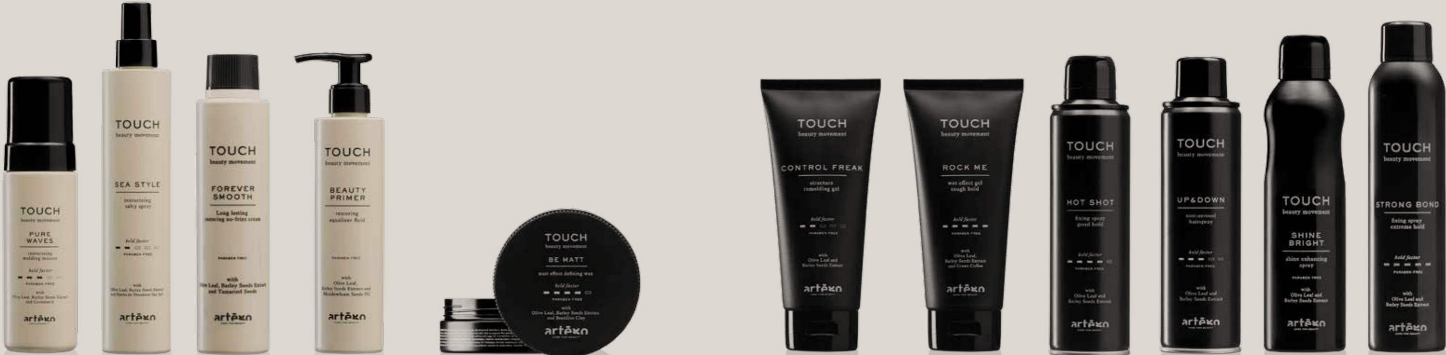
PURE WAVES SEA STYLE FOREVER SMOOTH BEAUTY PRIMER BE MATT CONTROL FREAK ROCK ME HOT SHOT UP & DOWN SHINE BRIGHT STRONG BOND Ecological no-gas mousse with cornstarch Spray formulated with precious Provence salt crystals Anti-frizz long lasting disciplining treatment with Tamarind seeds Revitalizing cream with Meadowfoam seed oil Matt effect wax with medium strong hold and Brazilian clay Molding gel with vegetable glycerin Strong gel with green coffee Medium-strong hold hairspray Medium hold no-gas hairspray Dry shining spray Strong hold hairspray